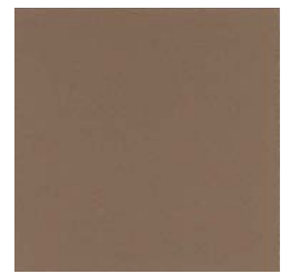
350 Desert Tan